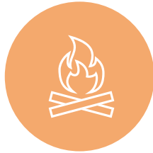
Summer Day Camp