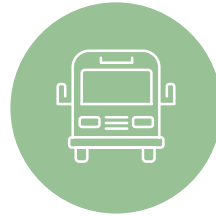
Care Provider Pick-Up/Drop-Off